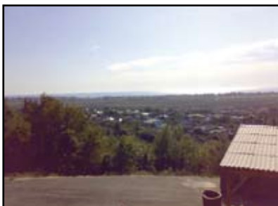
Sochi, site Winter Olympic Games, 2014