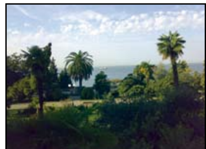
View from Sochi on Black Sea