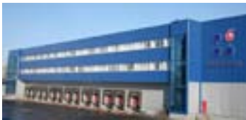
Victory for Lindab-Astron

This unique A-class storage terminal of 17.000 m 2 in Moscow, Russia, was voted the "Building of the Month" in March 2010. The storage was opened in 2008 on the territory of a major wholesale warehouse Victoriya in Moscow, Russia. Visiting it, the Mayor of Moscow Y.M. Luzhkov said, that this project was approved by Moscow Government as the one of high social importance for Moscow and the whole Central region. The terminal of 17.000 m 2 is fully automated and computerized. It provides clients with the opportunity of storing goods in 5 different temperature zones. This Astron steel building was constructed by ALAN-INVEST, an authorized Astron Builder from Moscow, Russia. Erection of the terminal was completed in 8 months, turn-key construction was finished in 18 months.